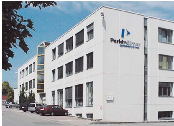
PerkinElmer HQ in Wiesbaden, Germany