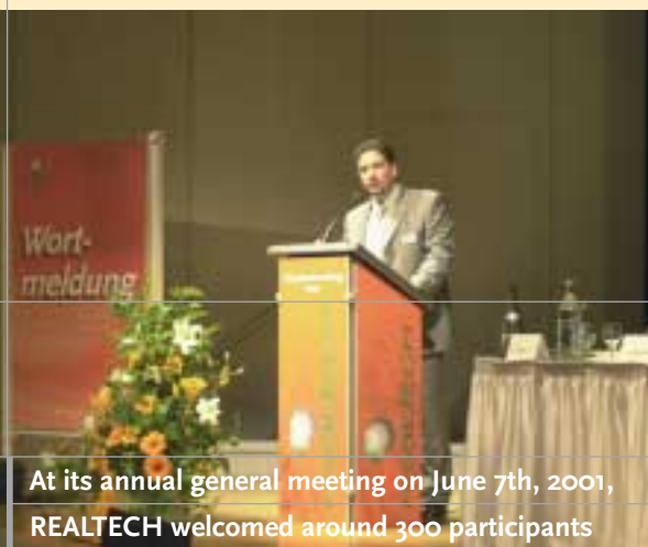
At its annual general meeting on June 7th, 2001, REALTECH welcomed around 300 participants

Whenever REALTECH communicates with investors, analysts and the financial press, the company always focus on transparency, openness, and visibility. In the year 2001, too, the group described its business development, strategy, and potential in numerous individual interviews, at roadshows, as well as in the context of analyst and balance sheet press conferences, and intensified its personal contact